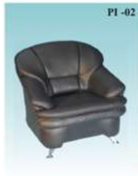
PI - 02