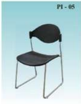
PI - 05