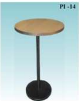
PI - 14