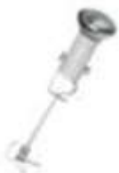
ME-E-02 100W Spot Light