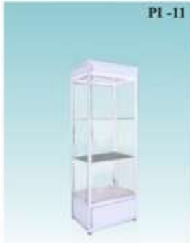
PI - 11