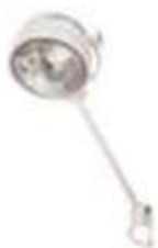
ME-E-01 150W Long Arm Light