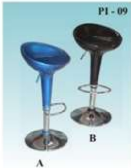
PI - 09