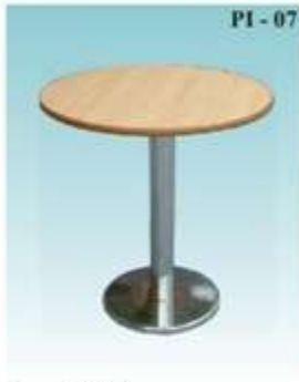
PI - 07