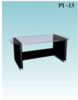
PI - 13