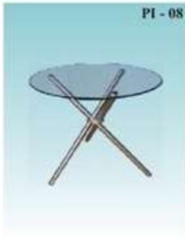
PI - 08