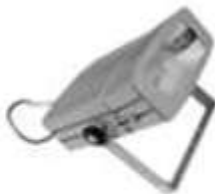
ME-E-03 150W Metal Light