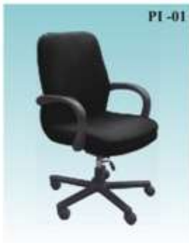
PI - 01