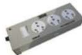
ME-E-06 15 AMP-Power Strip