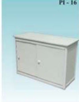
PI - 16