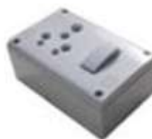
ME-E-05 15 AMP – Power Point