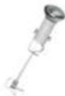
ME-E-02 100W Spot Light